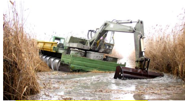
Digging Channels in the Reed Plant

The AMPHI CAT has been developed for several applications in water and muddy soils. Its use of Archimedean Screws for moving, allows the AMPHI-CAT to drive through various terrain conditions such as swimming through water, making its way through marshes and onto solid ground.