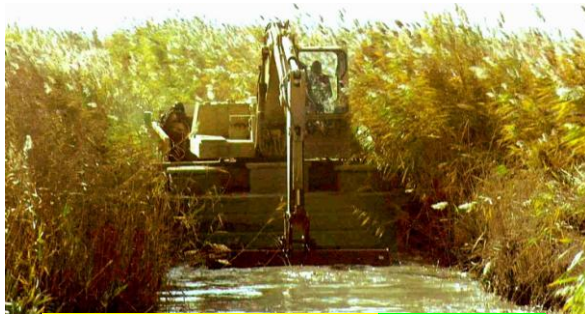
Digging Soft-Channels for sensitive Area

AMPHI-CAT (Basic) Dead Weight =19000 kg Gear and Hydrostatic for Screws