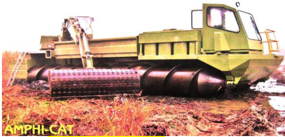
Ready for Operation