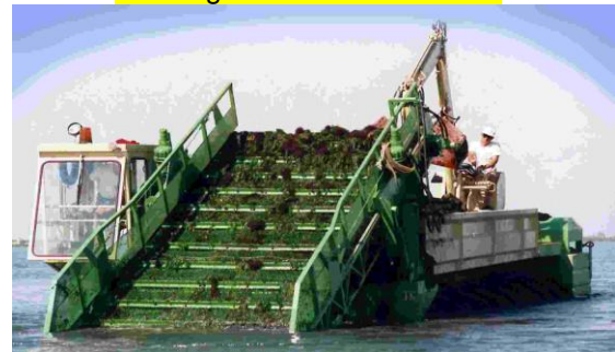
As a Mowing-Boat in the Adriatic-Sea