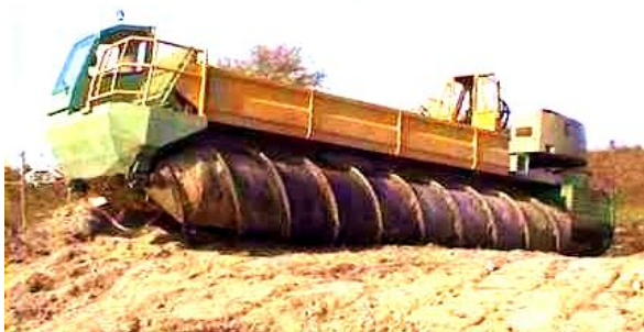
Going to Land (solid Ground)