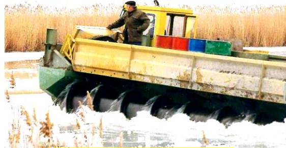
Cruising across a frozen Lake